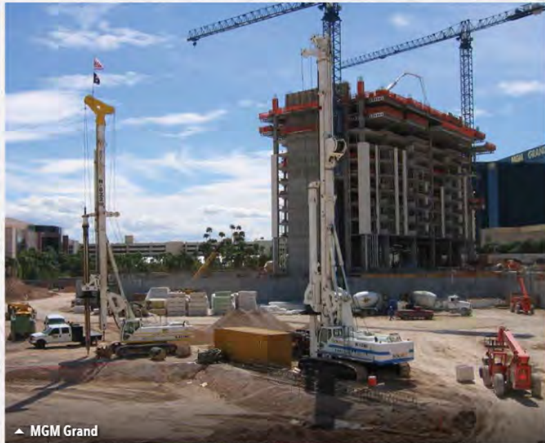
▲ MGM Grand

Work Scope: Foundations Drilled shafts, 3' to 6' dia., 40' deep Project Owner: Marnell Corrao