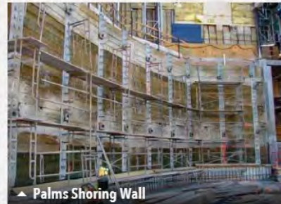
▲ Palms Shoring Wall