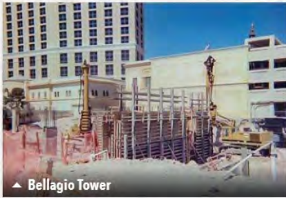
▲ Bellagio Tower