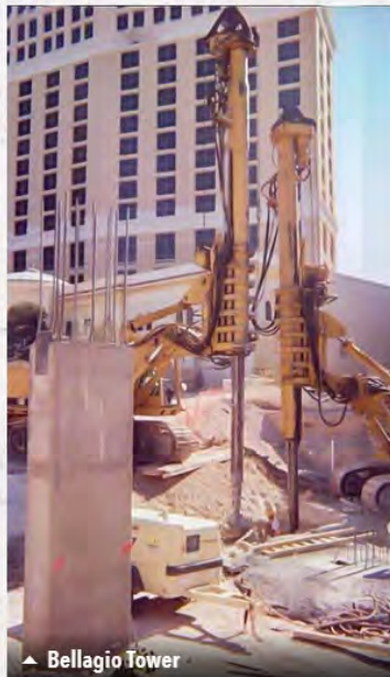
▲ Bellagio Tower