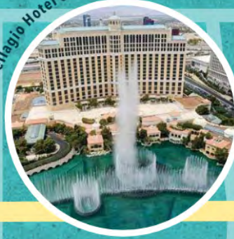
Bellagio Hotel & Casino, 2003