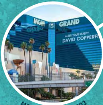
MGM Grand, 1992-1993