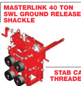
MASTERLINK 40 TON SWL GROUND RELEASE SHACKLE