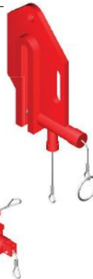
POSITIVE SAFETY GROUND RELEASE SHACKLE