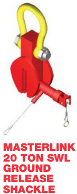
MASTERLINK 20 TON SWL GROUND RELEASE SHACKLE