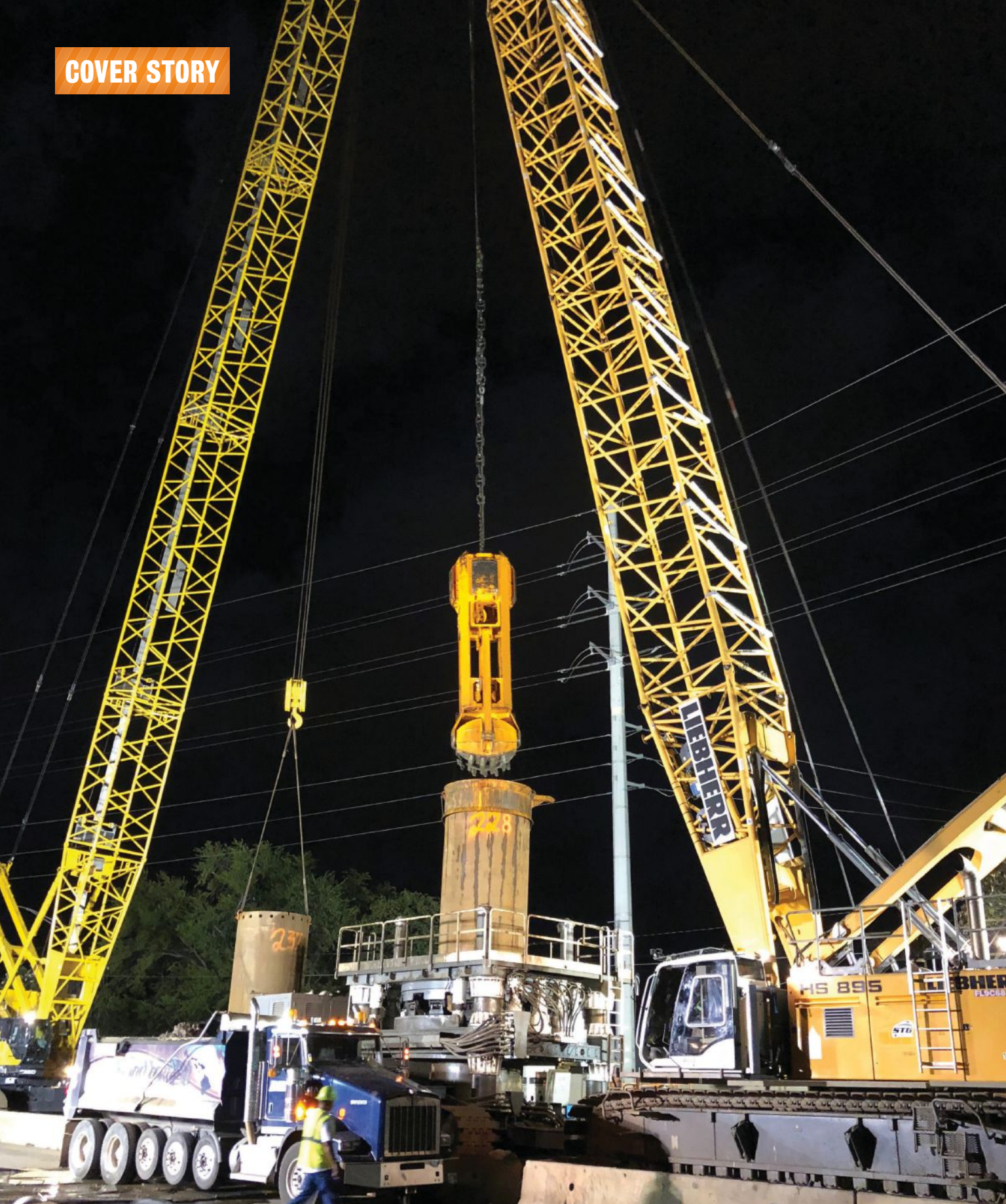
Honolulu, HA – Hart Project. 3M BUMA Rotator and Liebherr 895 crane installing 3M shafts up to 250 ft.