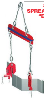
STAB CAT SPREADER BAR "DRESSED"