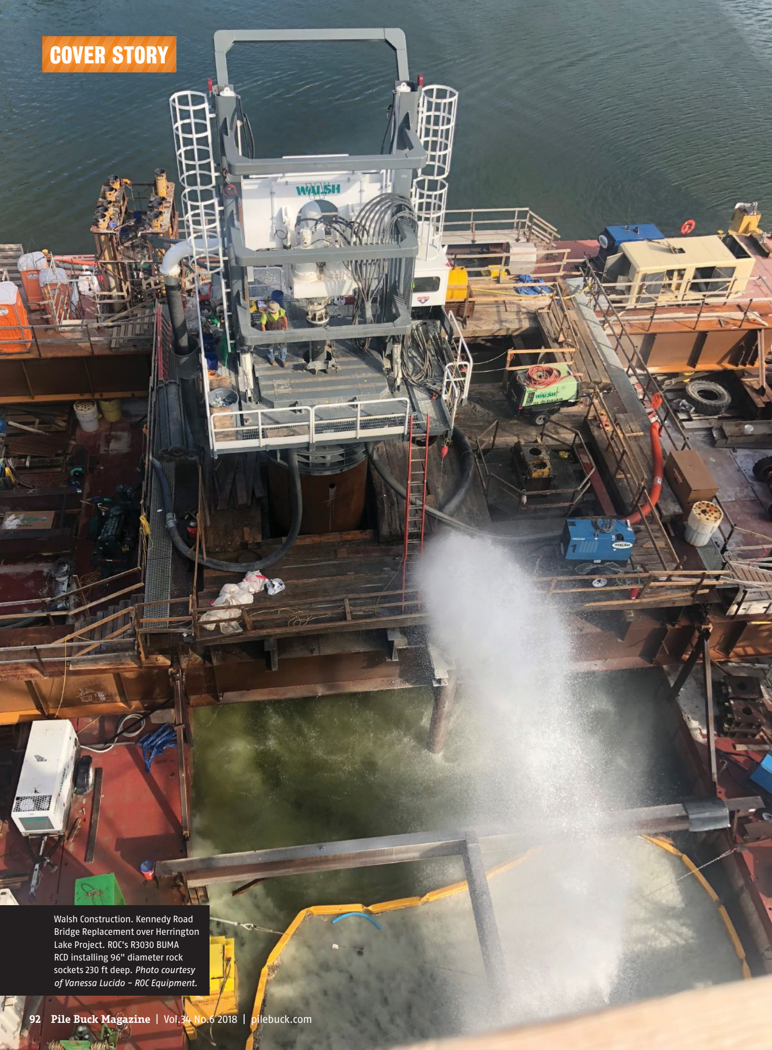
Walsh Construction. Kennedy Road Bridge Replacement over Herrington Lake Project. ROC's R3030 BUMA RCD installing 96" diameter rock sockets 230 ft deep.